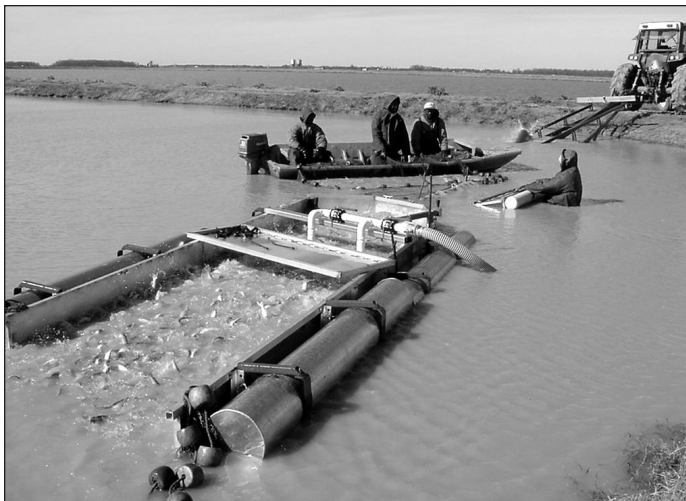
Figure 4b. In-pond horizontal bar grader in use.

sock, the net is attached to the eduction chamber. Water is pumped through the eduction chamber, which directs fish and water up and onto the floating platform grader (Fig. 4b). Smaller fish escape through the grader and return to the pond, while larger fish swim off the end of the grader and into a separate live car. The bar spacing on the floating platform grader is adjustable from 2 inches down to \frac{1}{2} inch. For a more detailed description see SRAC Publication No. 3901, Components and Use of an In-Pond Fish Grading System .