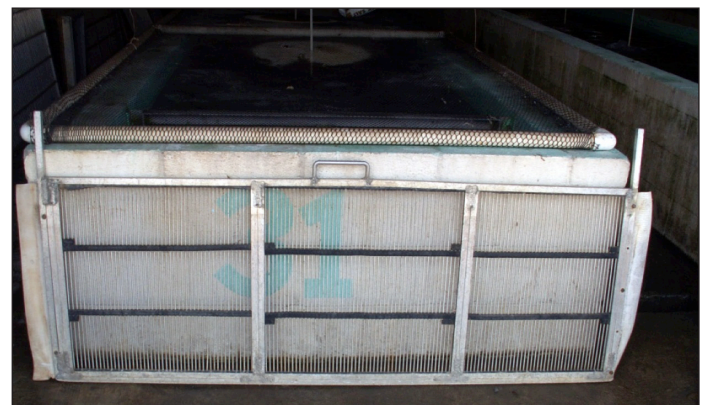
Figure 2. Custom panel grader.

Panel graders or drag graders also have smooth bars evenly spaced and welded or bolted to a rectangular frame (Fig. 2). Since vats can vary in size, the graders are generally equipped with adjustable clips on the sides and rubber flanges that allow them to fit snugly against the vat walls. Panel graders usually have handles to make moving them easier. The grader is placed vertically to the tank bottom and pulled from one end of the vat to the other. Larger fish are retained and smaller fish swim through the bars. This process can be repeated several times using a smaller grader each time. Panel graders require less handling of fish and cause less stress than box graders.