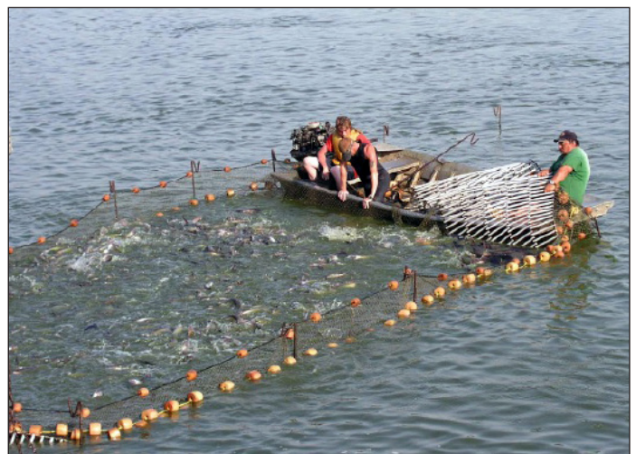
Figure 3b. Flexible panel grader being used to grade hybrid catfish.