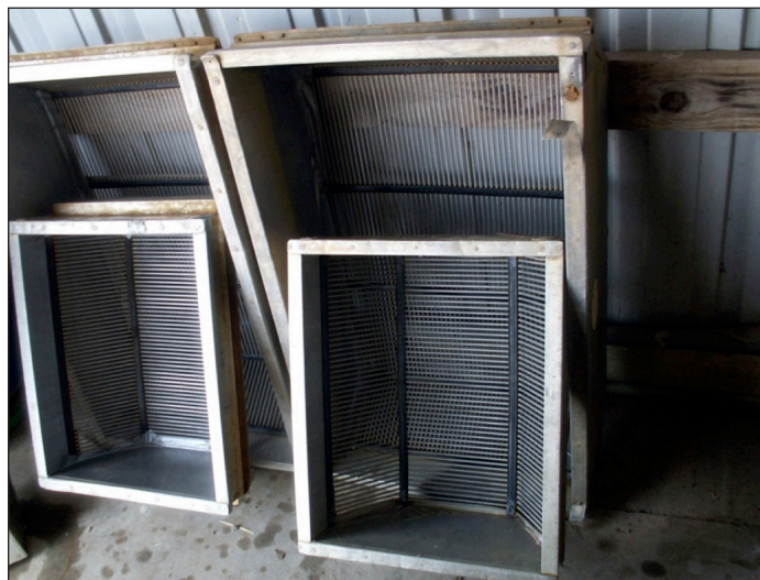
Figure 1. Grading boxes.

Box graders are designed to float in a vat (Fig. 1). The frame holds interchangeable baskets made of \frac{3}{16} -inch aluminum bars held at equal spacing by rubber bars. Spacing