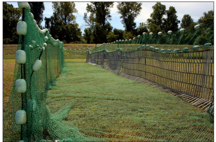
Figure 3a. Flexible panel grader.

A flexible panel grading sock is a standard small-mesh sock that has been fitted with three or four 15-foot x 40-foot flexible grid panels with a set aperture (Figs. 3a and 3b). Sections of the sock side walls are cut out and flexible panels are sewn in. The mesh in the rest of the sock is small (usually around 1 inch) so fish can be graded only through the flexible grid. This is particularly useful for species that cannot otherwise passively grade from a net because of their body shape. The flexible panels can be made with bar spacings of practically any size necessary. Although this grader was developed for hybrid catfish, it is also used to grade other species.