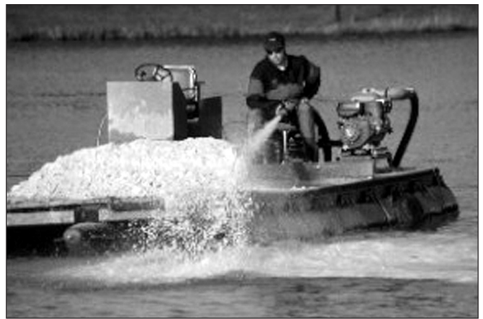
Figure 3. Agricultural lime being distributed evenly over a pond from a pontoon barge.

If the pond contains water, lime should be applied evenly over the entire pond surface. Lime is loaded onto a boat or barge and then shoveled or washed uniformly into the pond (Fig. 3). Often a sheet of plywood can be attached across the front of one or two small boats and the lime placed on the plywood. Lime is heavy and shoveling it is tedious. Therefore, some pond owners hire professional companies with liming barges to spread the lime. For small ponds of less than 1 acre, liming trucks can be backed up to the edge of the pond and the lime distributed with the spreader on the truck. This method works best if the truck can move around the entire pond and broadcast the lime evenly.