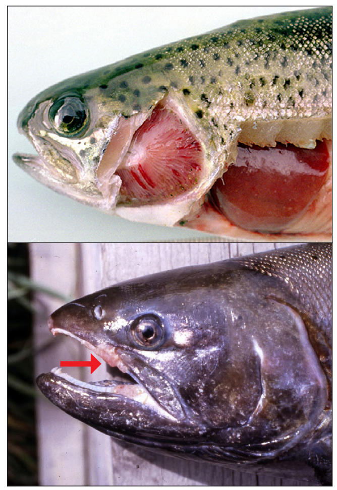
On the top is a rainbow trout with OMV disease. The pale gills and white spots on the liver are typical symptoms. On the bottom is a wild Masu salmon with a jaw tumor (arrow) caused by OMV.

There are two well-known herpesviruses of salmonids. They are Salmonid herpesvirus-1 (SalHV-1) and Salmonid herpesvirus-2 (SalHV-2; common name Oncorhynchus masou virus or OMV). The SalHV-1 was initially isolated from rainbow trout in the state of Washington, but it is not an important cause of disease. OMV, however, does cause an important disease in Pacific salmon and in rainbow trout. The disease is usually characterized by skin ulcers and red or white spots in internal organs. Survivors often