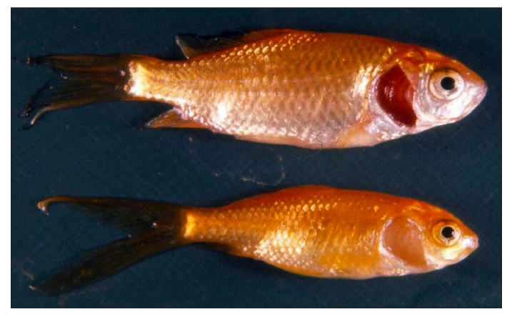
A goldfish with normal red gills (above) and a goldfish with anemia and the pale gills typical of GHV disease (below).

The disease can be prevented if the combinations of stress and temperatures in the 70s (°F) can be avoided. It can be treated by elevating temperatures into the low to mid 80s (°F). At these higher temperatures, the fish's immune system is able to successfully defeat the disease. Of course, surviving fish are GHV carriers.