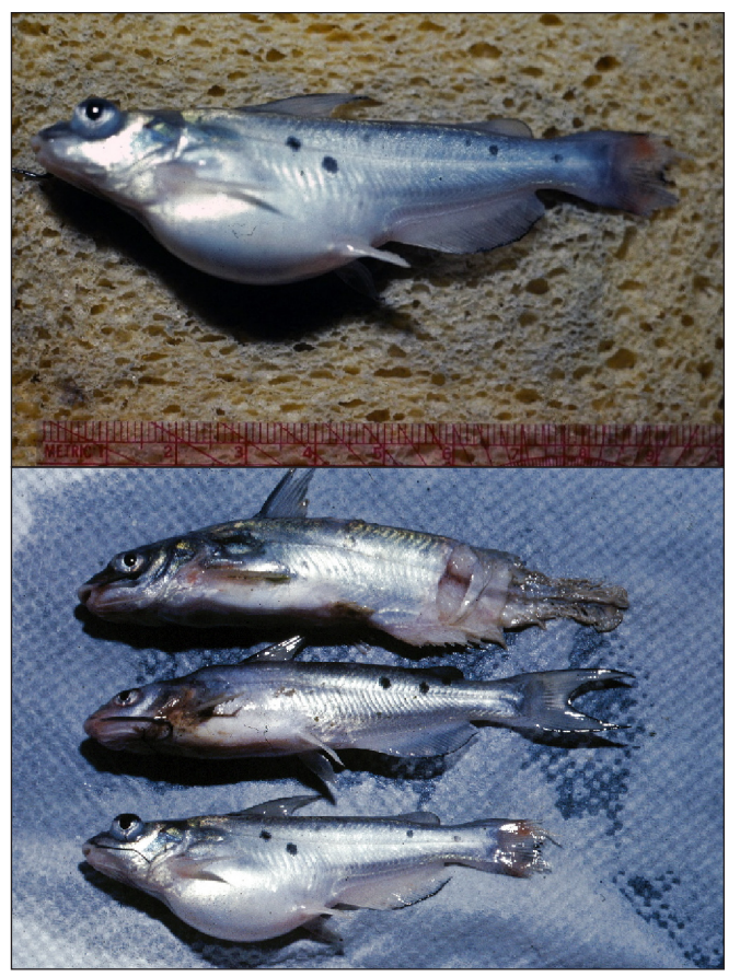
These very famous pictures of CCV disease are from the collection of Dr. John Plumb. The fish on the top has a swollen abdomen and pop-eye typical of CCV. The fish on the bottom have CCV, but also a co-infection by columnaris bacteria. The swollen abdomen is from CCV, while the eroded fins and tails are caused by columnaris disease.

catfish. Given that channel catfish are commonly reared in state hatchery and stocking programs, it is also very likely that CCV is widespread in wild catfish populations. As with carp pox and the GHV, catfish producers assume that the virus is present and manage their facilities to reduce the probability that the disease will develop.