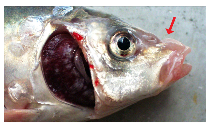
This fish does NOT have KHV. The white patches of gill tissue are the result of a columnaris bacterial infection. Also noticeable on this fish is a "notched nose." Some koi owners consider a "notched nose" to be a sign of KHV disease, but it is also clearly noticeable on this fish with only a bacterial infection.

Because the KHV is avoided instead of managed, biosecurity and sensitive tests for carrier fish are tremendously important. These issues will be discussed in later sections of this publication.