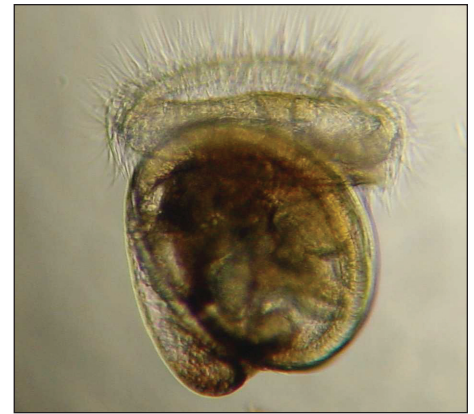
Figure 6. Veliger larva.