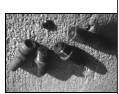
Fig. 7. PVC tubing connectors with constriction orifice.