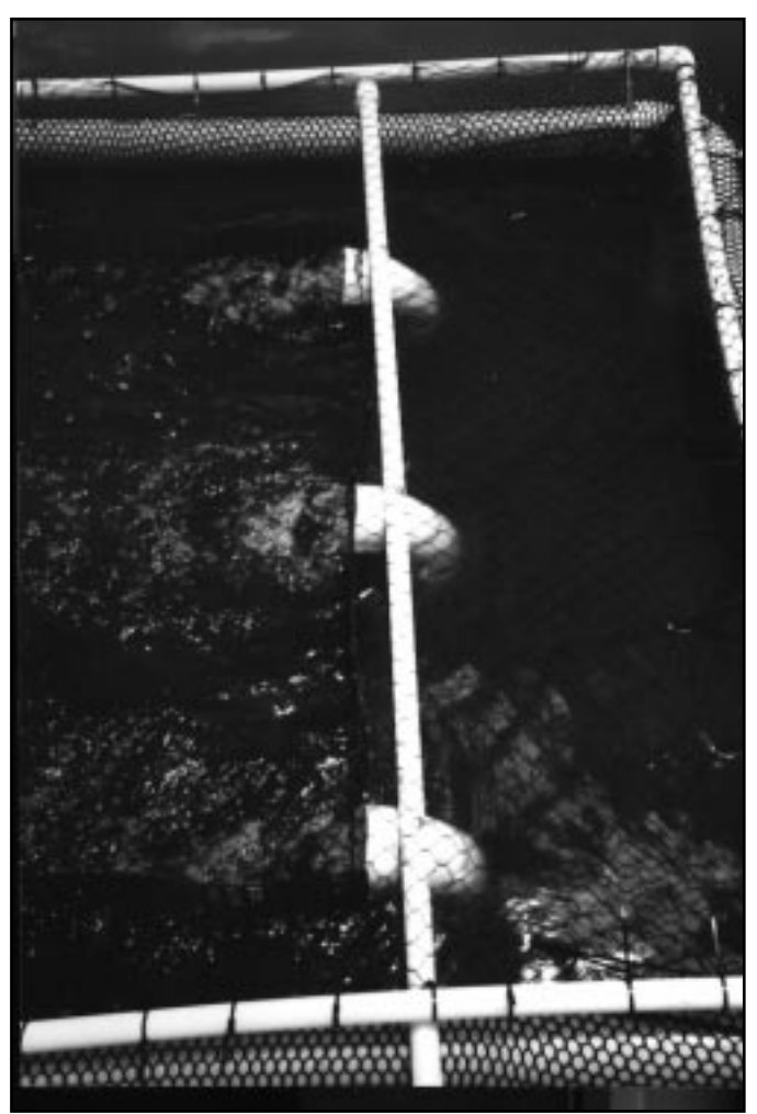
Fig. 6. Air-lifts inside cage.

Most air-lifts should be constructed to be approximately 36 inches long with an "elbow" at the upper end (elbows at the bottom are optional). Air-lifts can be attached to the outside of the cage or hung in the cage (see Figure 6). Air-lifts will not lift water more than a few inches above the pond's surface and therefore should be attached to the cage as close to the water surface as possible. Air-lifts must be attached to the cage(s) at the same level and held straight vertically, not tilted. The place the hose connects to the air-lift must be between 30 and 34 inches below water level, and all air-lifts must have hoses attached at the same level. A constriction orifice (see Figure 7) must be placed in the air line going to each air-lift, where it attaches to the air manifold. Orifice size should be between 1/8 and 3/16 inch in diameter (3/16-inch diameter is common) and all the same size. The constriction orifice equally distributes air to all air-lifts and stabilizes water flow through each airlift.