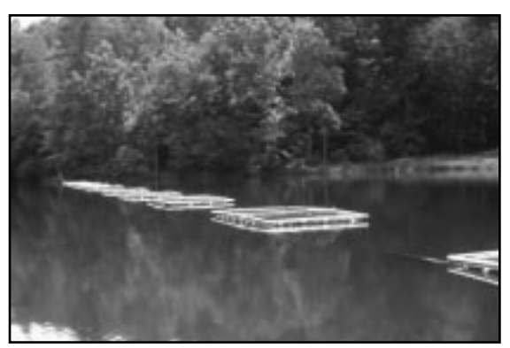
Fig. 4. Cages properly separated across pond with no pier.