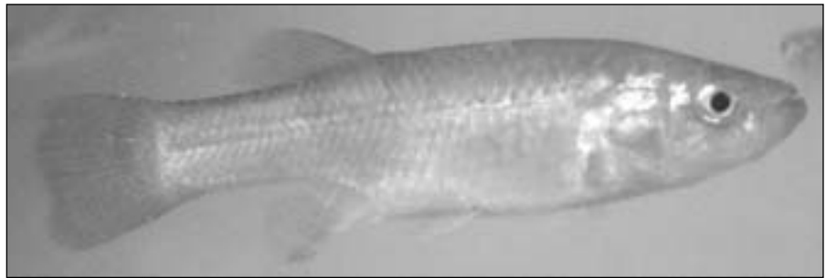
Figure 1. Female bull minnow.

The most cited system is one that uses three phases to produce bait-size bull minnows. Other strategies are possible and perhaps preferable, but the three-phase system is a documented plan and a starting point that can be modified based on experience and resources.