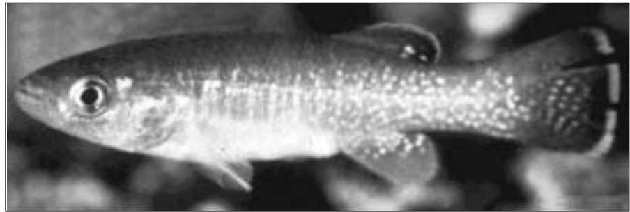
Figure 2. Male bull minnow.