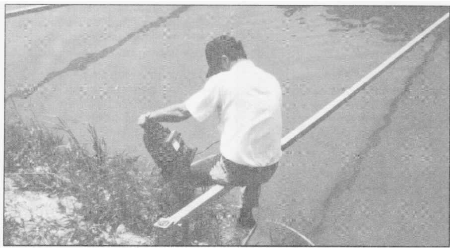
Routine oxygen testing is an important management tool.

Observe the fish in the hauling tank. Remove a few fish from the tank (particularly any that look or act unnatural) and check them closely. Look at the gills. If gills of several fish are pale, eroded or bloody, the fish are probably either sick or highly stressed. If signs of disease are visible, fish should be treated in the hauling tank or placed into a holding tank or small pond where they can be isolated from other fish and