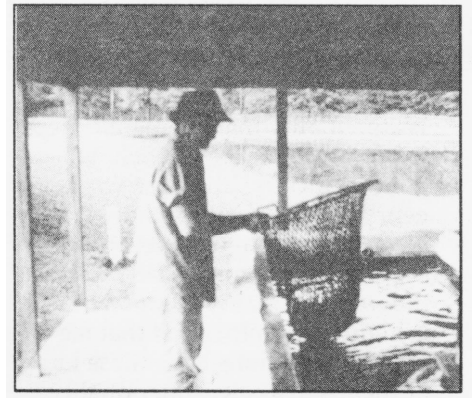
"Hook-shy" fish can be seined from ponds and held in live wells for sale to customers.

"Hook-shy" fish are not easily caught and tend to accumulate in the pond, reducing the remaining carrying capacity of the pond and fishing success. Good recordkeeping on the weight of fish removed will suggest how many fish can be restocked without over-loading the pond, and will give a fairly accurate account of the weight of "hook-shy" fish remaining in the pond. As many as 30 to 40 percent of the fish in a pond can be unmatchable or "hook-shy."