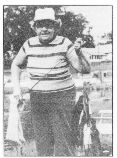
People management is the key to running a successful fee-fishing operation.

management. For information on these and other aspects of fee-fishing please refer to SRAC Publication Numbers 479 (Fee-fishing: An Introduction), 482 (Fee-fishing: Location, Site Development and Costs) and 481 (Development and Management of Fishing Leases).